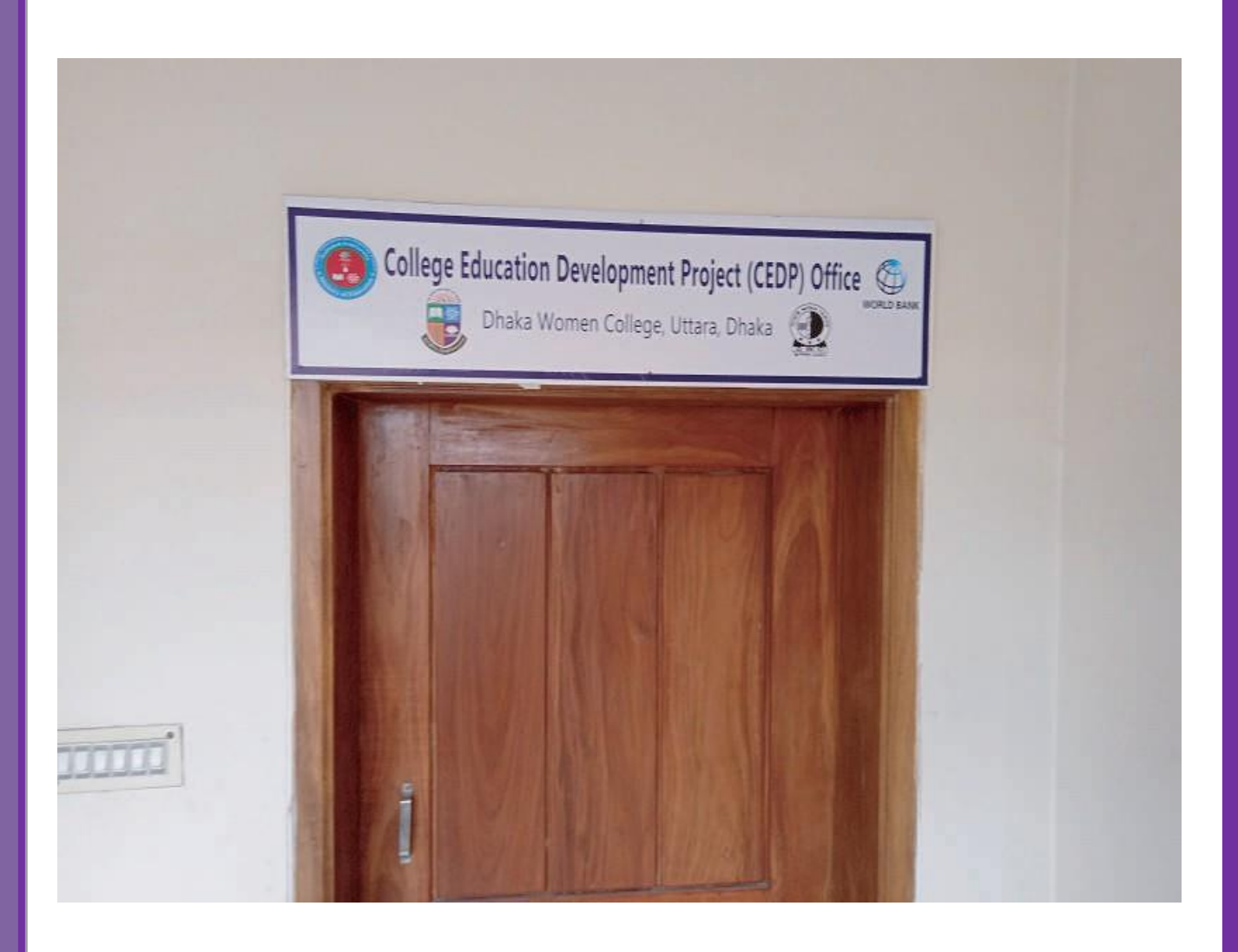
IDG- CEDP Office at Dhaka Women College