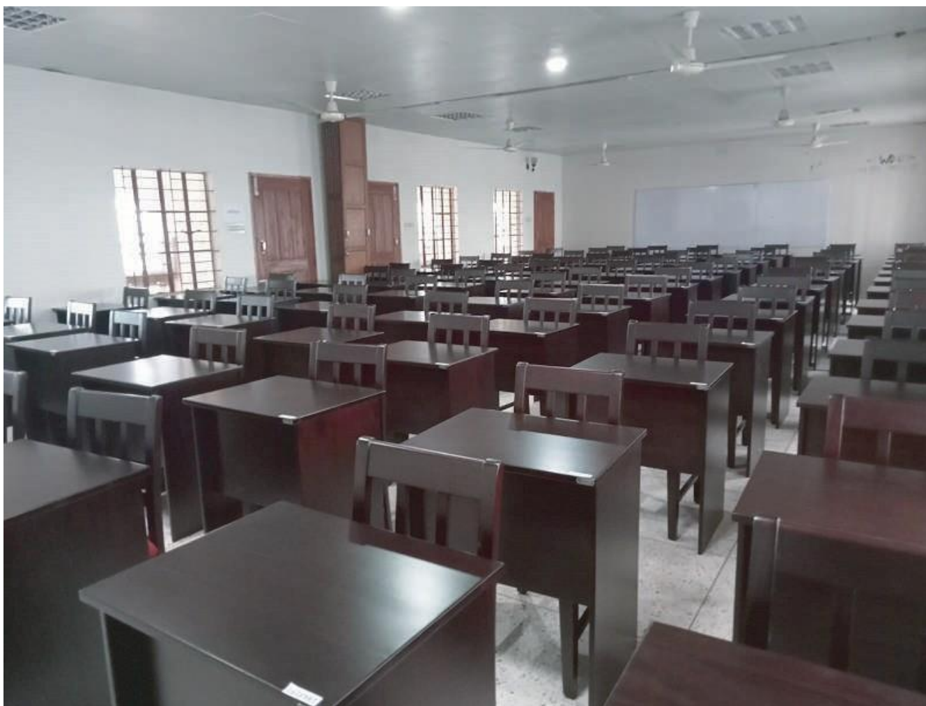
Chair-table from IDG fund -CEDP