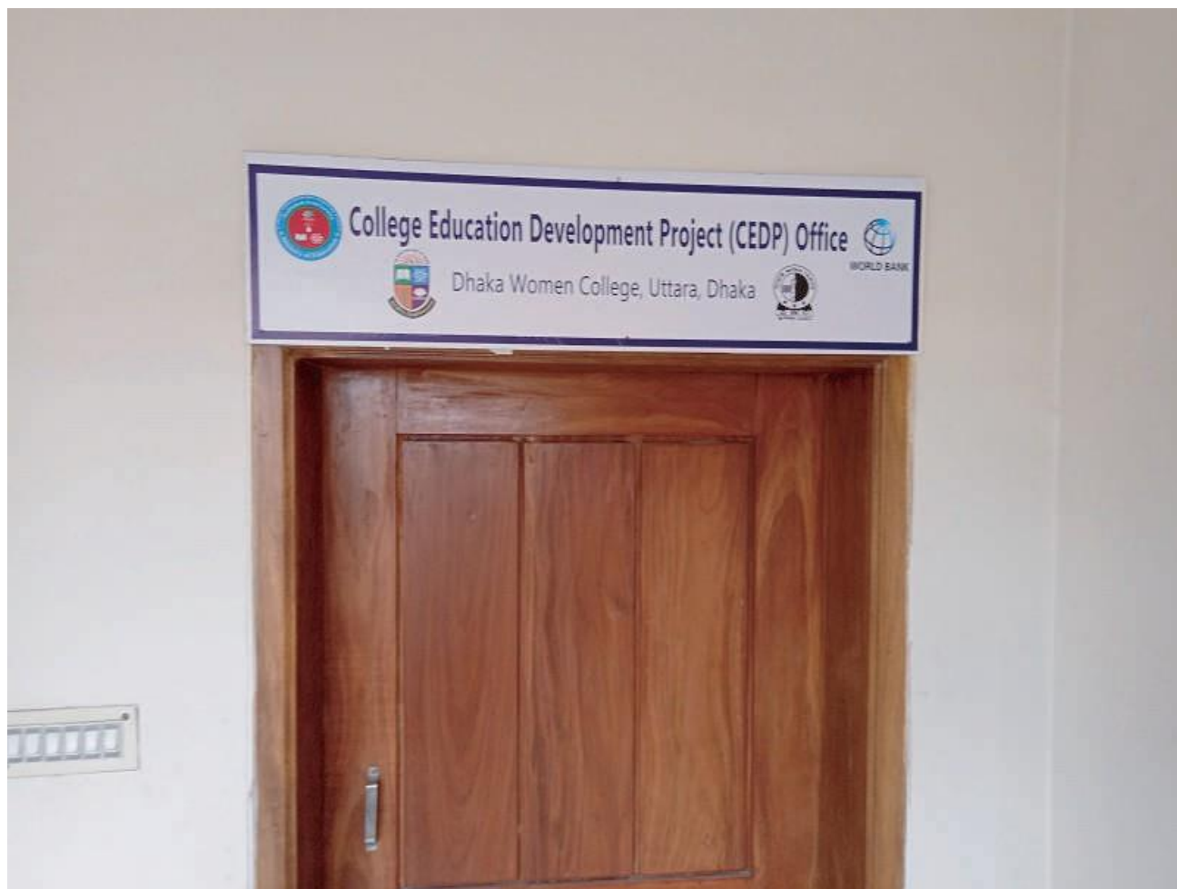
IDG- CEDP Office at Dhaka Women College